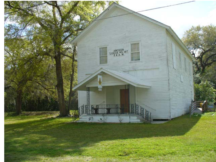
The Archer Masonic Lodge, one of Archer's many interesting historic buildings.

Please contact Archer City Hall if you have any questions or concerns about anything in the city. Our City staff is here to serve and assist the citizens of Archer. By contacting us directly, you give us the opportunity to address whatever issue you may have in the fastest manner possible. While you certainly may contact other citizens, please remember they have no more input or importance than you. The City encourages and desires open lines of communication. We look forward to building our city together.